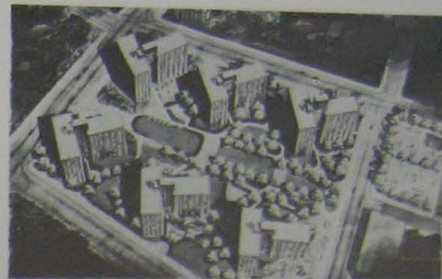
Gun Hill Houses

For Board of Trade members, there is available, on request, complete information on all the public housing projects in the Bronx. This information includes up-to-date data on boundaries, income limits, contracting firms, architects and other pertinent material.