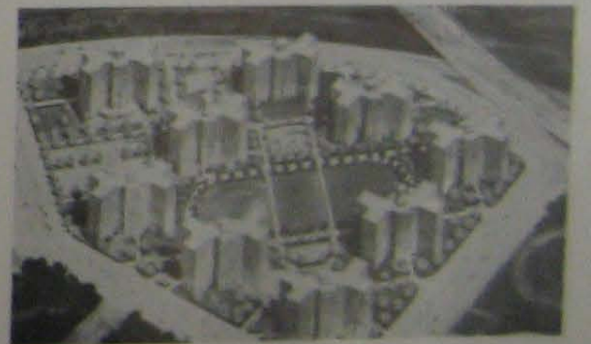
Ross & Breen Houses