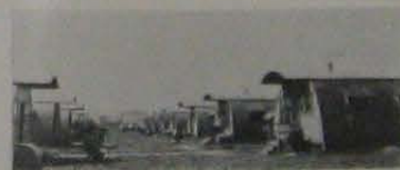
Castle Hill—Temporary Veterans Emergency Project