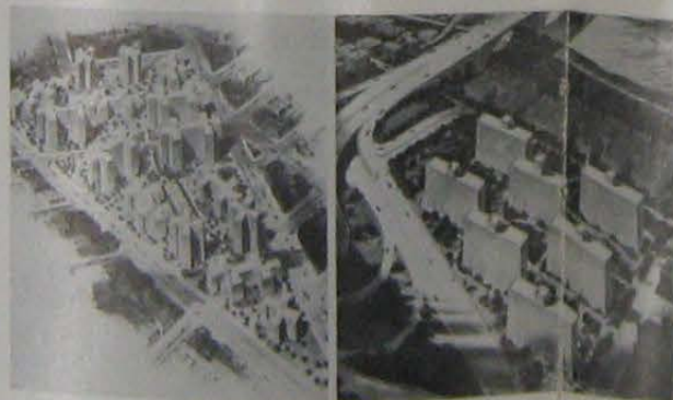
Left, Lester W. Patterson Houses. Right, Sedgwick Houses