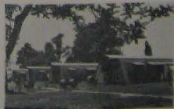
Brucklet Houses—Temporary Veterans Emergency Project