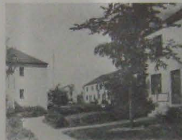
Clason Point Houses