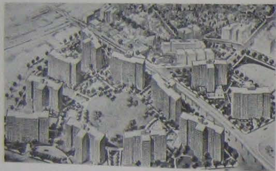
Marble Hill Houses