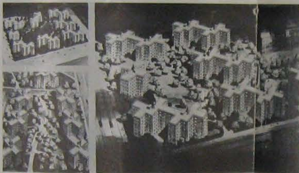
Pelham Parkway Houses