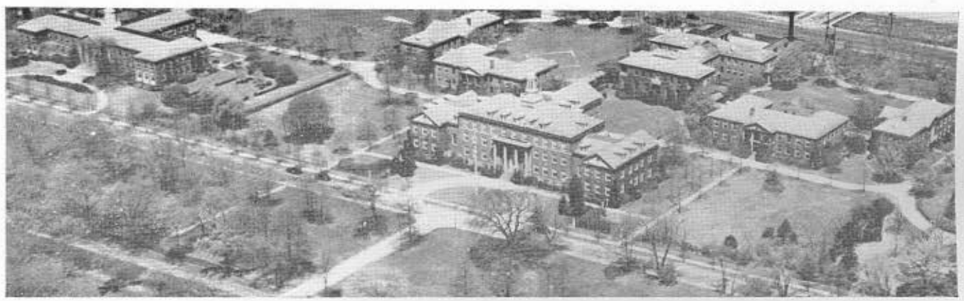
New York Institute for the Education of the Blind