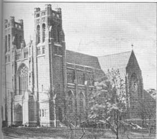
St. Nicholas of Tolentine Church