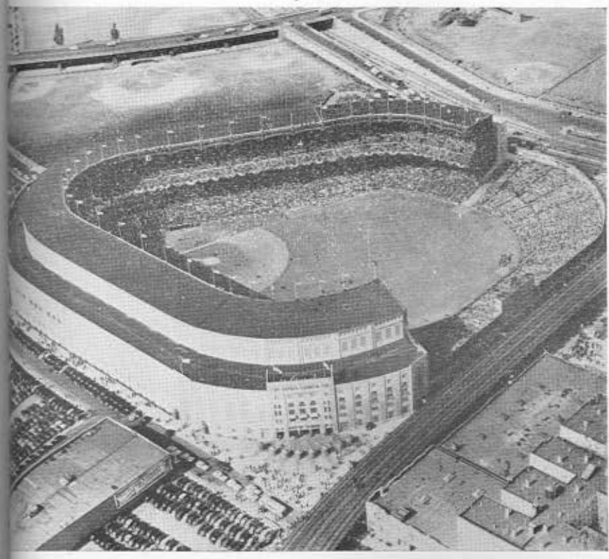
Home of World Champions—Yankee Stadium