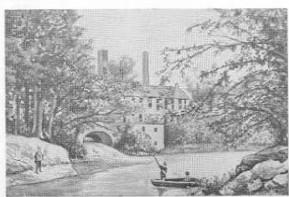
Snuff House—Botanical Gardens