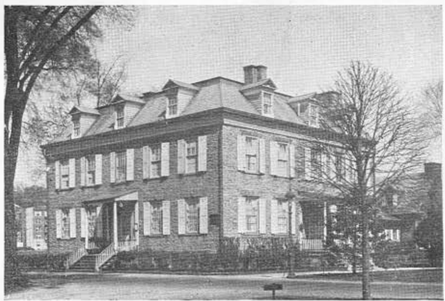
Van Cortlandt Mansion