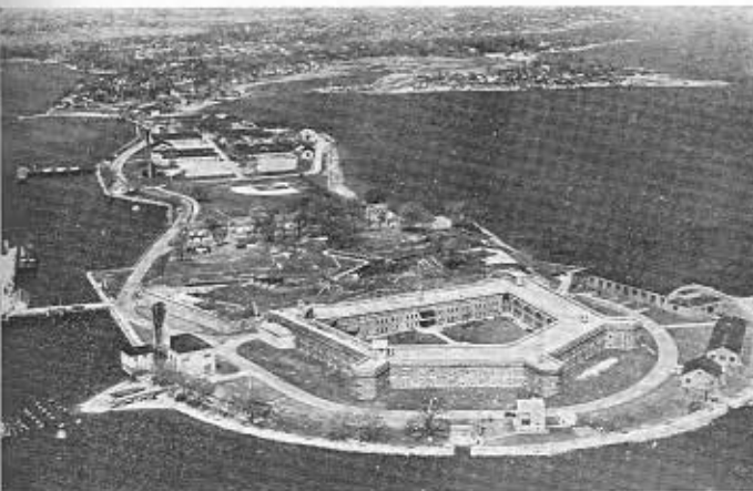
N. Y. State Maritime College, Fort Schuyler