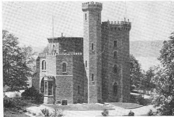
Fonthill Castle at College of Mt. St. Vincent